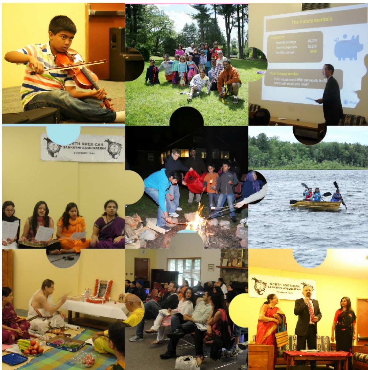
Photos of NASA's 2013 Annual Meeting, at Vanderkamp Retreat Center